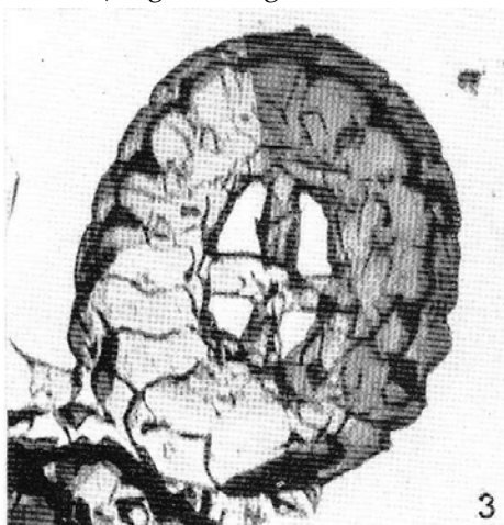
Pl. 32, fig. 3

Figs. 21, 25. Deflandrius quadripunctatus (Górka, 1957) n. comb., 3000X, fig. 21, holotype, plan view, phase contrast, CO 20, Męcierz (10,3/99,5), fig. 25, long axis 0° to x-nico1s, CO 22, Kazimierz 1 (13,5/99,7).