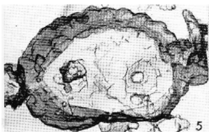
Pl. 33, fig. 5

Fig. 11. Nephrolithus miniporus n. sp., CO 20, Męcńmierz 1 (18,2/97,3), plan view, phase contrast, 3000X.